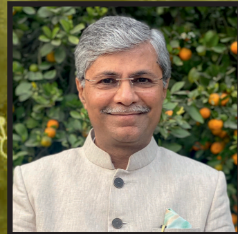
Shri Prataprao Jadhav, Union Minister of State in Ayush (Independent Charge), Ministry of AYUSH, Govt. of India